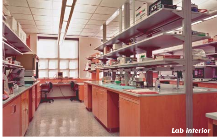
MacDonald Laboratory University of California